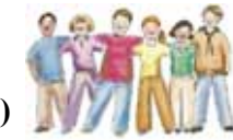
Youth Group News!

1) Beach Day: May 22nd (Saturday) we will be meeting up with North Brevard, Oceanside, Holly Hill, and Melbourne Churches of Christ at New Smyrna Beach for a day of fun at the beach. Come hang out with us before finals hit. This will be a good pre-summer fellowship opportunity for you! Cost is $10 per student. More info will be available soon as far as times.