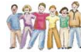
Youth Group News!